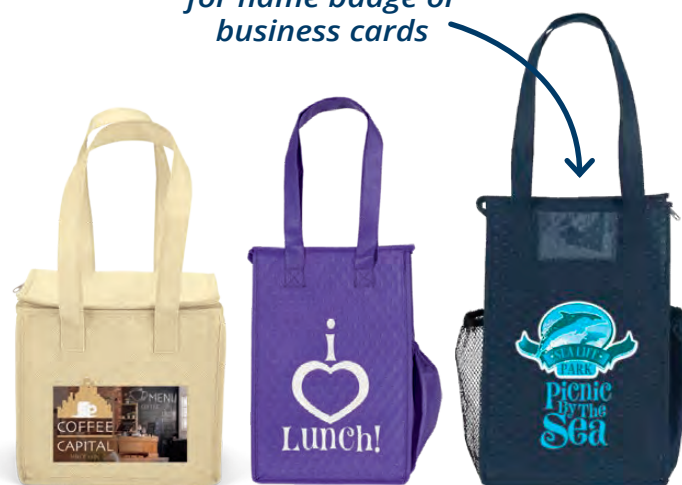
THERM-O COOLER TOTE

Clear front pocket for name badge or business cards